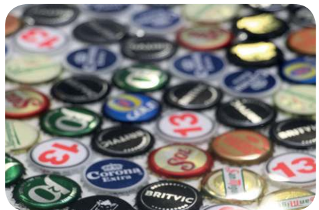
GlassCast® 3 poured over a Lego Technic Coffee Table and over a Bottle-top Bar-top.

For more information and lots of project ideas take a look at the Easy Composites product pages and Tutorials for in depth guides and case study projects.